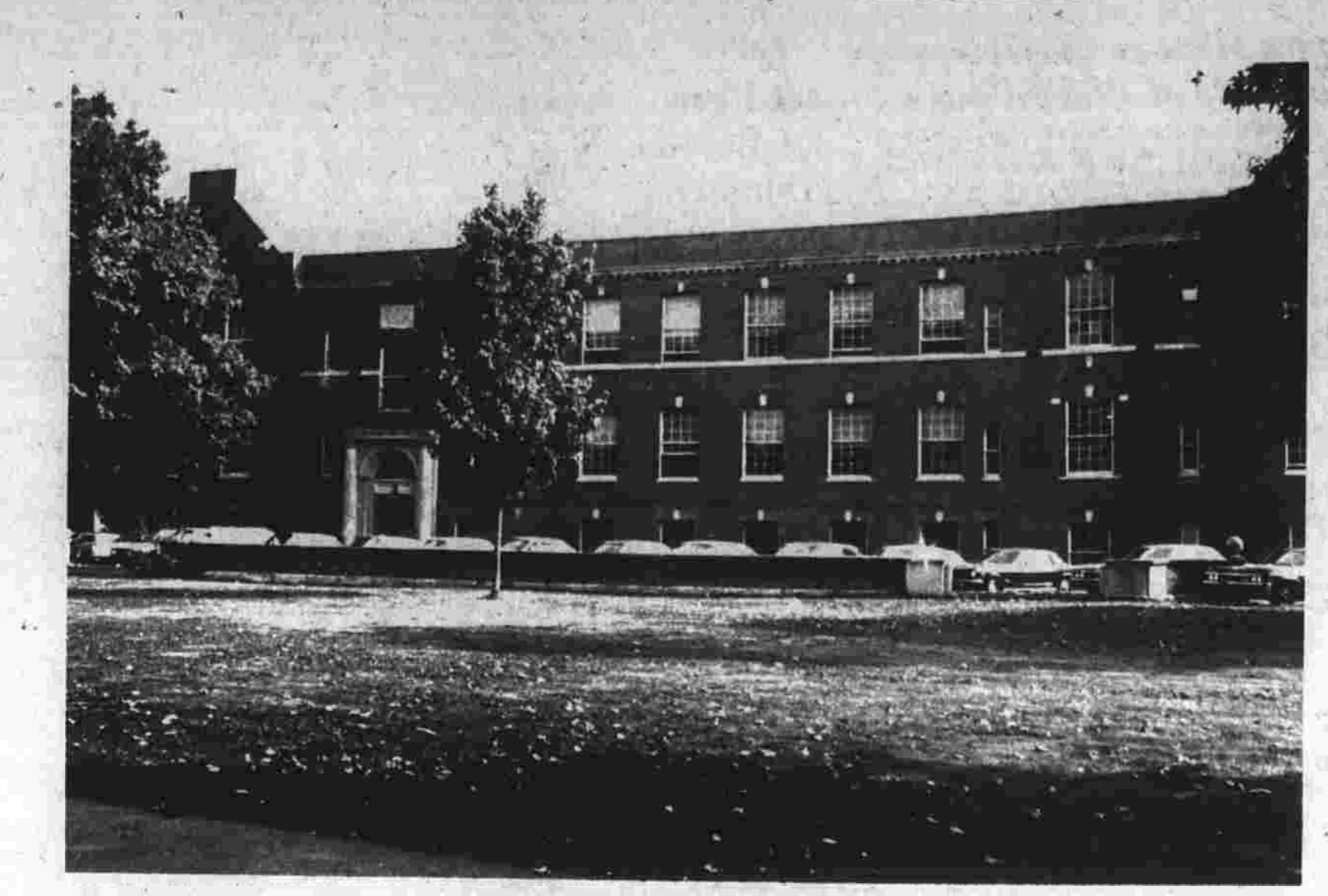
BENNETT JUNIOR HIGH

Vote Republican! Vote Republican! Vote Republican!