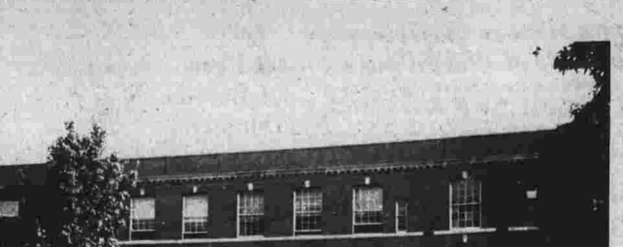
BENNETT JUNIOR HIGH

Vote Republican! Vote Republican! Vote Republican!